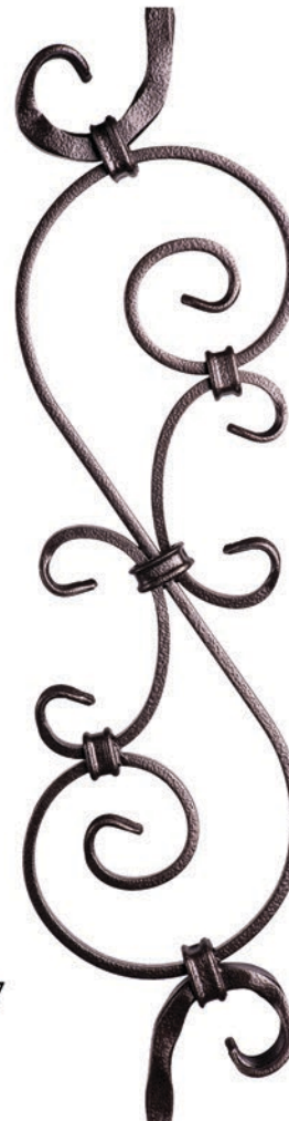
HFCV2.9.8 Ends : 9/16" Sq. Height: 44" Wt. 5.2 lbs. SOLID