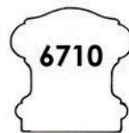
6710 Prestige Hand Rail HT. 2-3/4" W. 2-5/8"