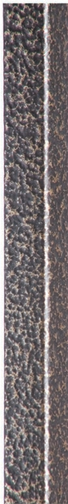
HFCV16.2.1 Ends : 1/2" Sq. Height: 44" Wt. 3 lbs. SOLID