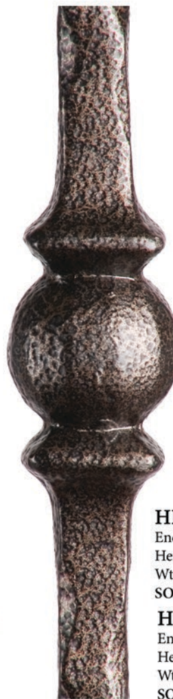
HFCV16.1.26 Ends : 9/16" Sq. Height: 44" Wt. 4 lbs. SOLID