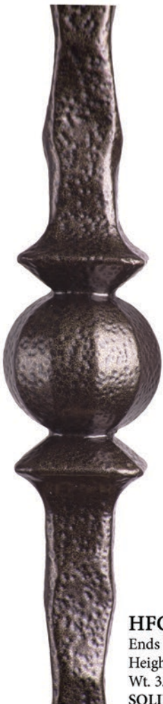
HFCV2.9.28 Ends : 9/16" Sq. Height: 44" Wt. 3.2 lbs. SOLID