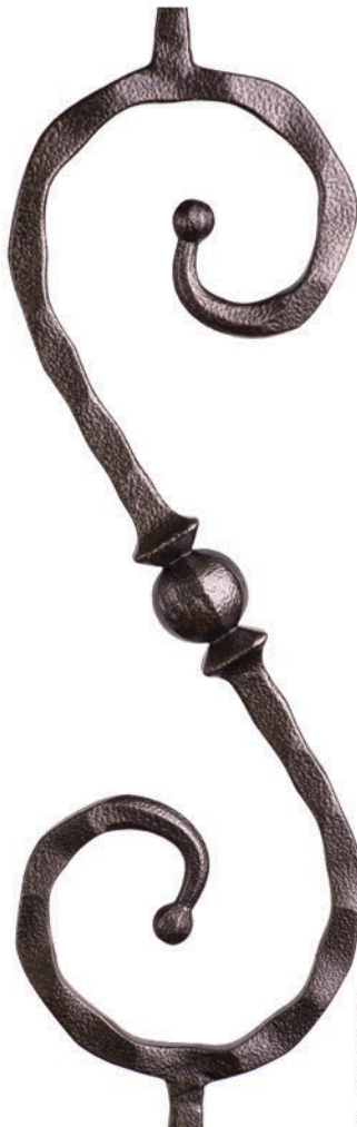
HFCV2.9.27 Ends : 9/16" Sq. Height: 44" Wt. 4.2 lbs. SOLID