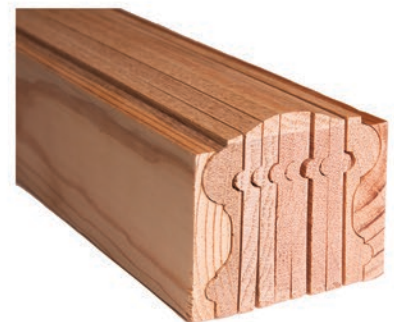
16' Bending Rail (Red Oak)

Call or email your sales representative for full pricing details